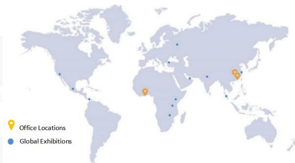
Pic No. 8