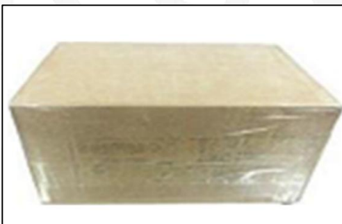
Pic No. 5

Domestic Express Packaging: Wrapped with Transparent tape