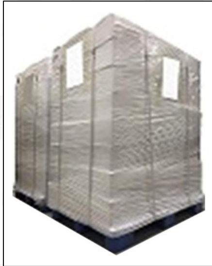
Pic No. 7

Pallet Shipping: Use pallet that meet export requirements, and use white wrapping protective film to wrap and bind with cable ties