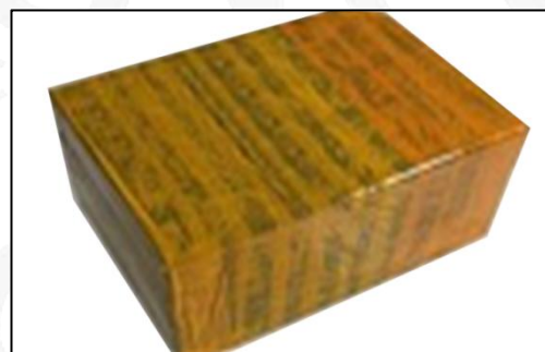
Pic No. 6

Domestic Express Packaging: Wrapped with Transparent tape